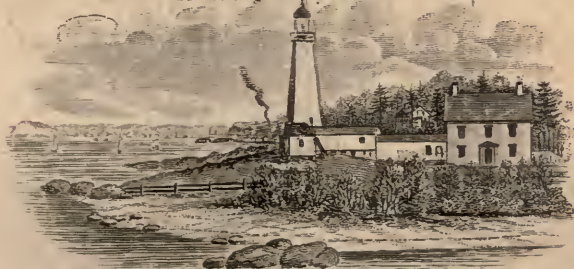
View of the Light House S. of New Haven Conn. Fort Hale, the Chemical Works, East & West Rocks; New Haven seen in the distance.