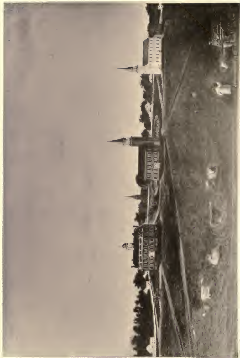
Colonial State House.